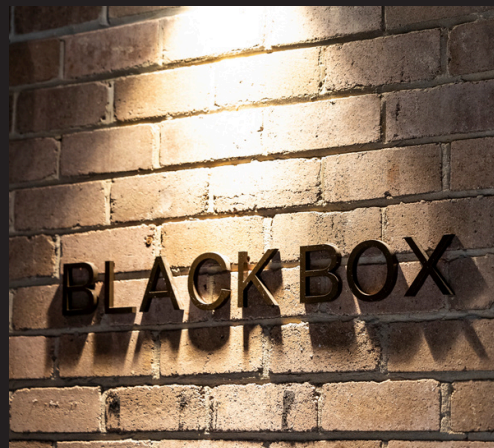
Ground Floor Access